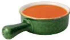
Tomato soup 200 gram (half a large tin)