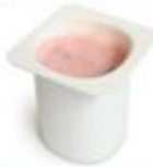
Low fat yoghurt 150 gram (1 small pot)