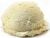
Plain vanilla ice-cream 1 large scoop